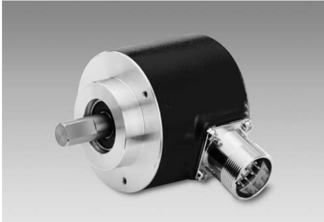
GA240 with clamping flange