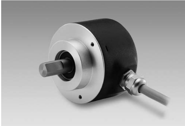
GPI0W with clamping flange